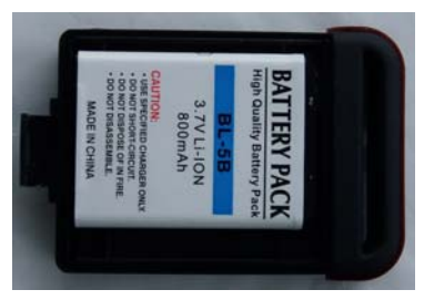
Install the battery like this.